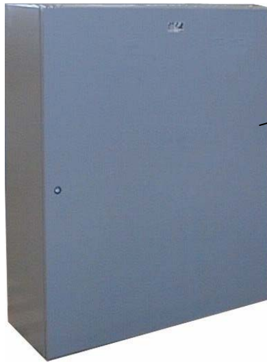
STANDARD 12, 30 AND 42 POLE VERSIONS